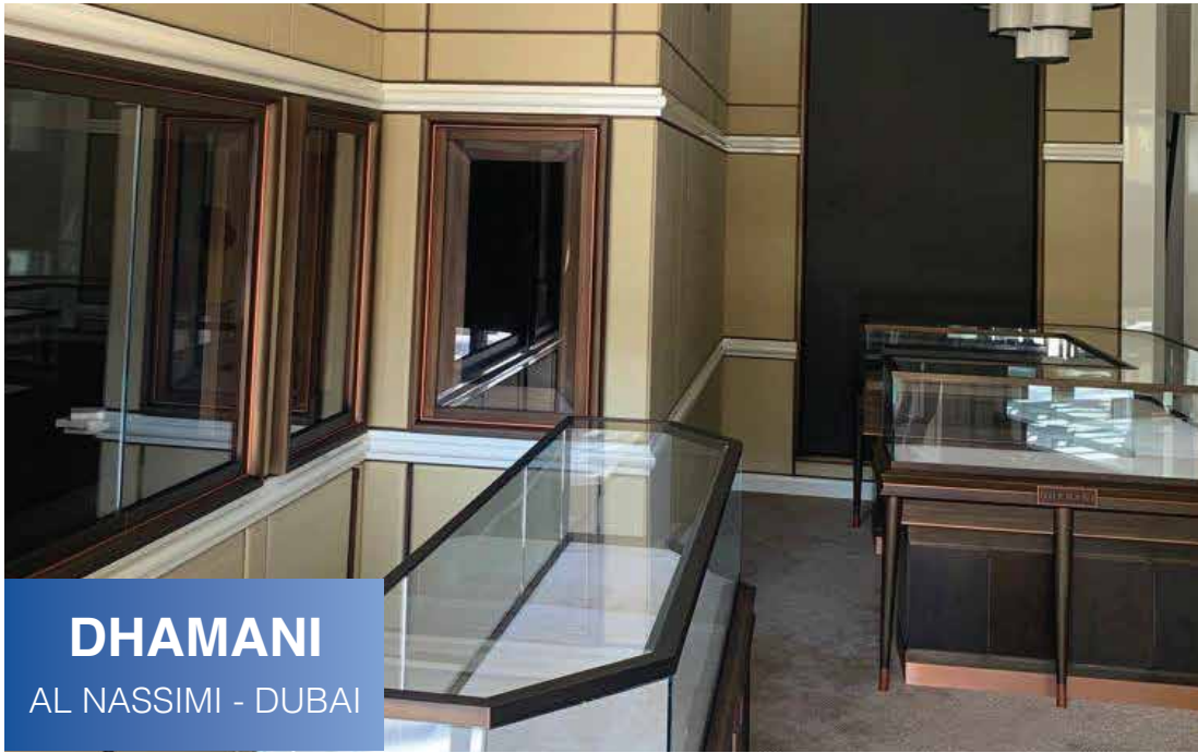
DHAMANI AL NASSIMI - DUBAI